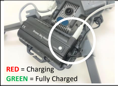
CHARGING: Connect the Micro USB cable to the battery-pack and to a USB charger