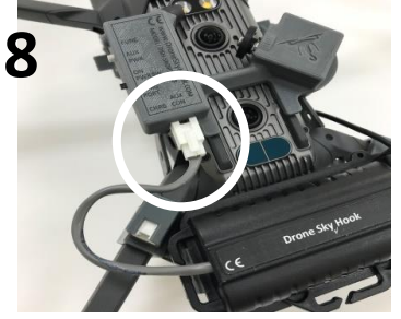
Connect the GREY wire plug to the Sky Hook PLUS - AUX CON port and verify it is locked in place