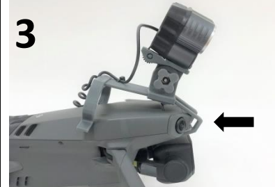
Slide back the Head-Unit from the drone's front-end (above the drone's camera)