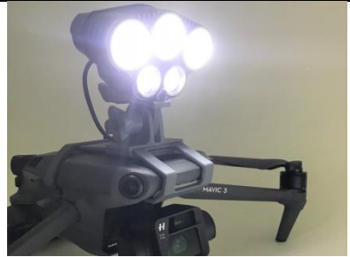
Operation when combined with the Sky Hook Release PLUS device: Turn ON the Sky Hook's AUX Port to set the Searchlight ON.