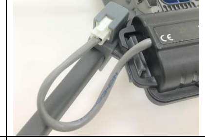
Operation when installing only the Searchlight: