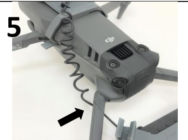
IMPORTANT: Route the spiral wire BELOW the REAR LEFT drone's arm