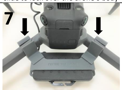
Verify that both sides of the Battery Pack are locked over the drone's rear arms and that the Battery Pack in centered