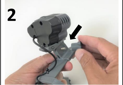
Install the bolt and nut in the Head-Unit, set to desired angle and tighten the nut (only by hand)