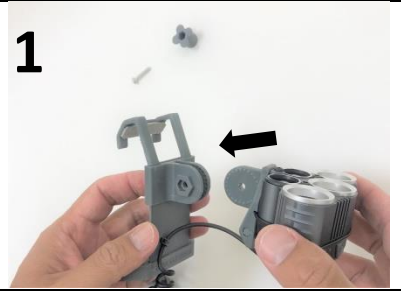
Remove the bolt and nut from the Head-Unit Bracket and slide the LEDs Head-Unit into place