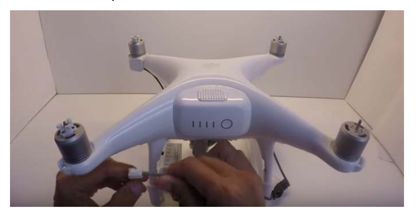
Locate the SearchLight battery plug. It is a polarized connector with a locking tab.