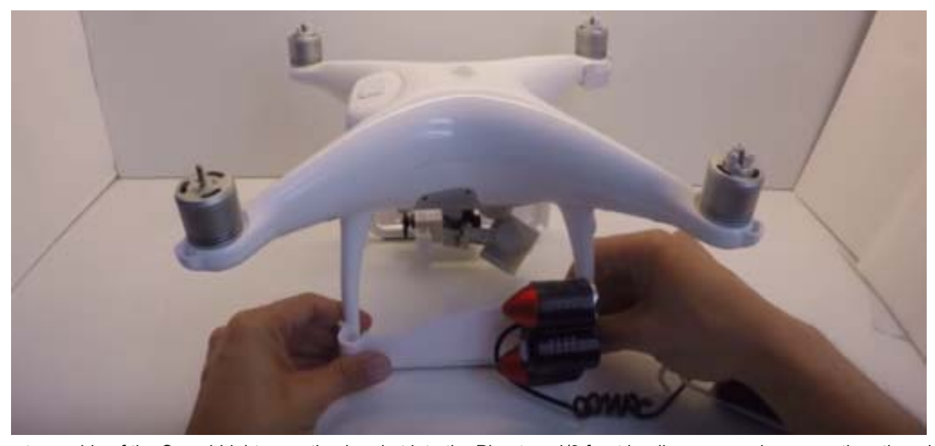
Insert one side of the SearchLight mounting bracket into the Phantom 4/3 front landing gear and snap-on the other side

Installation of Drone-Sky-Hook LED SearchLight with Built-In Laser Pointer for DJI Phantom 4 and Phantom 3