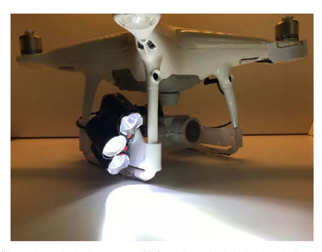
Before takeoff loosen the rotation knob, rotate your LED Searchlight to the desired angle and tighten the rotation knob