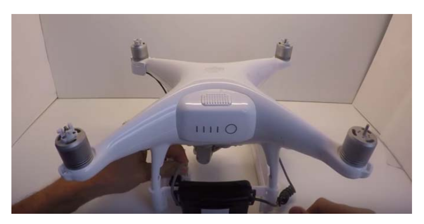
Observe the correct orientation of the SearchLight battery plug and plug it into the AUX jack on the Release & Drop PLUS Device. The plug should be locked to the AUX jack.

Move the battery cable towards the nearest landing gear and away from the view of the sensors located on the bottom side of the Phantom (VPS sensors).