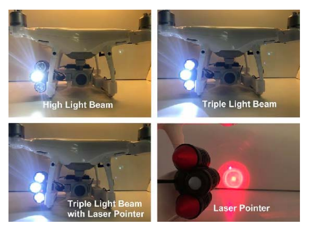
SearchLight operation modes