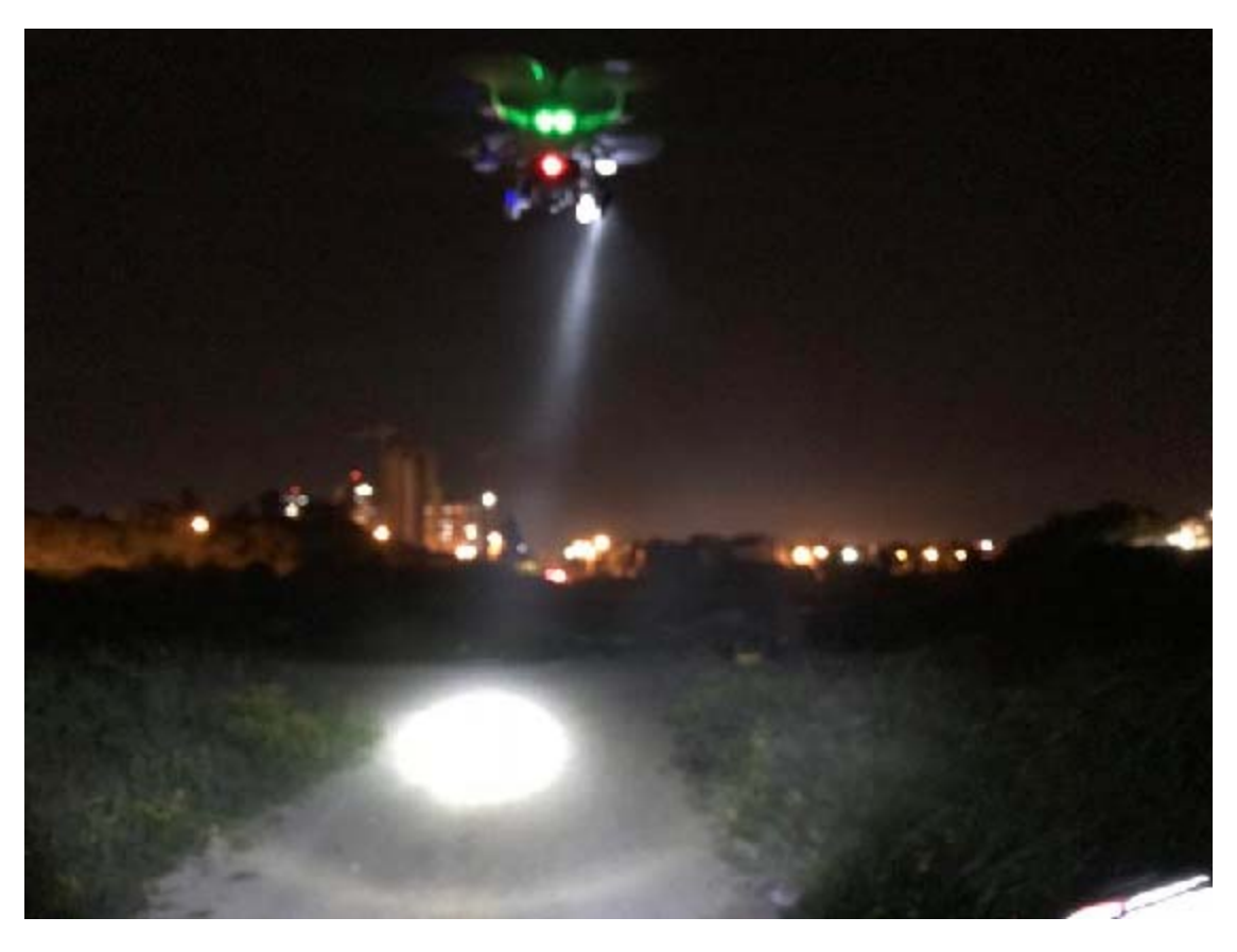
Page 11 of 12