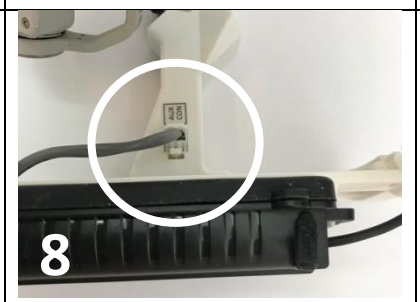
Connect the GREY wire plug to the Sky Hook's AUX CON port and verify it is locked in place