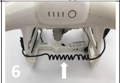
Verify that the spiral wire is routed BEHIND both REAR landing gears