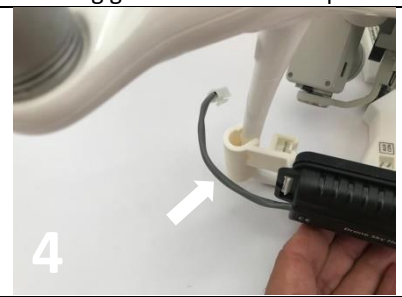
Slide the FRONT SIDE of the Battery-pack bracket over the FRONT LEFT landing gear until it locks in place