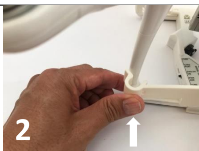
Slide the REAR SIDE of the LED bracket over the REAR RIGHT landing gear until it locks in place