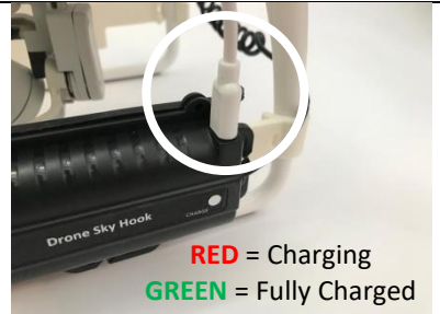
CHARGING: Connect the Micro USB cable to the battery-pack and to a USB charger