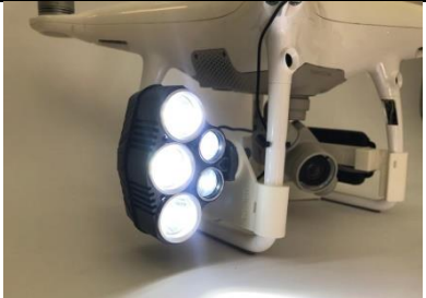
Operation when combined with the Sky Hook Release PLUS device: Turn ON the Sky Hook's AUX Port to set the Searchlight ON.