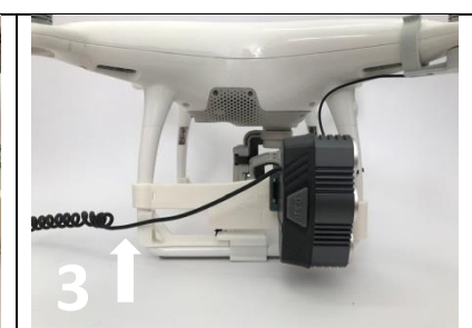
IMPORTANT: Route the spiral wire BEHIND the REAR RIGHT and REAR LEFT landing gear