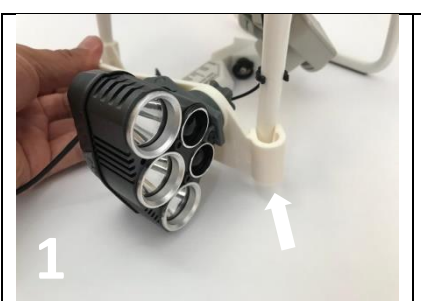
Slide the FRONT SIDE of the LED bracket over the FRONT RIGHT landing gear until it locks in place