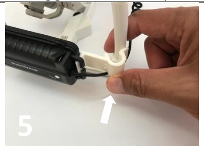
Slide the REAR SIDE of the Batterypack bracket over the REAR LEFT landing gear until it locks in place